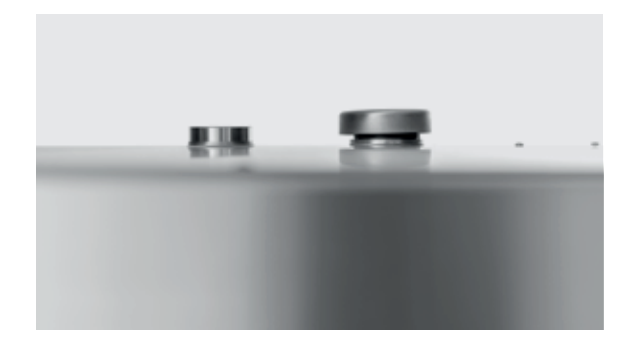
A highly powerful flap will provide an immediate discharge of residual moisture from the cooking chamber. This will result in a perfect crispness and accurate colour of foods.