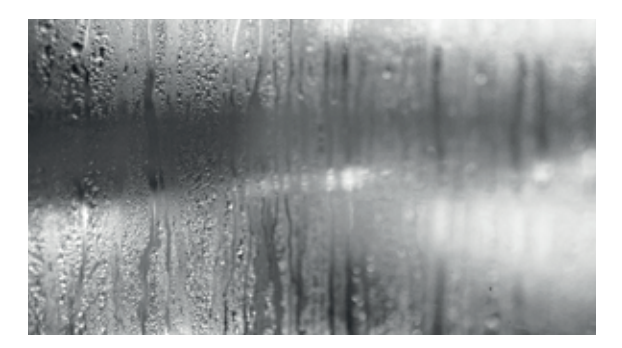
The automatic humidity control system (AHC) precisely regulates the amount of steam in the cooking chamber and creates the ideal climate for the meals that are being prepared.