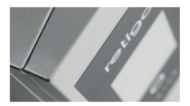
Quality austenite (non-magnetic) stainless steel (AISI 304 and 316) and the minimal use of plastic components greatly extends the lifetime of the Retigo Vision.