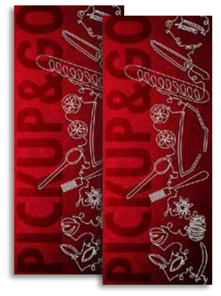
CSFLEXMERCH2 — Pickup & Go