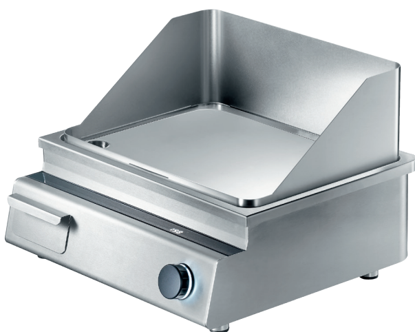
INSTINCT Griddle 3.5/5