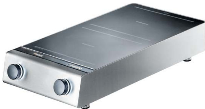
INSTINCT Hob 10