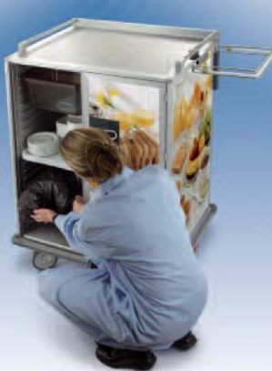
End of tray pick up, garbage bag inside trolley