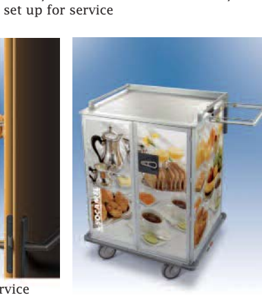
End of service