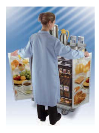
Door opening before service