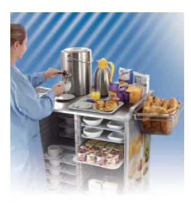
Tray assembly in corridor