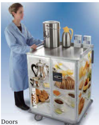
closed for transpor-tation to service destination