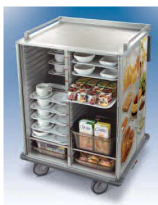
Trays set up with crockery keeping space for food storage