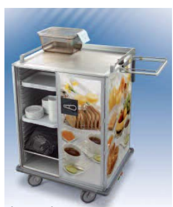
Clean pit door closed, dirty pit door opened for trays collection