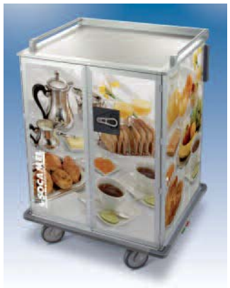
Servizio stored in kitchenette