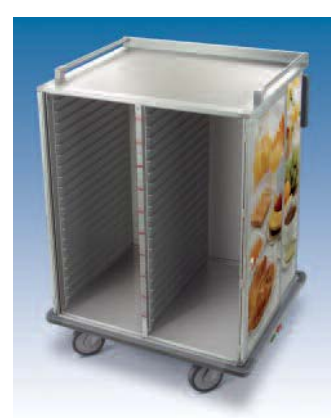
Doors opening with magnet side holding