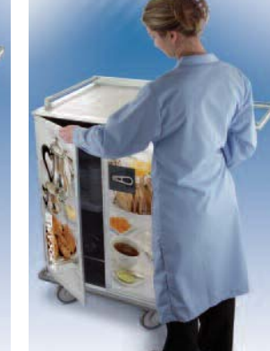
All doors closed