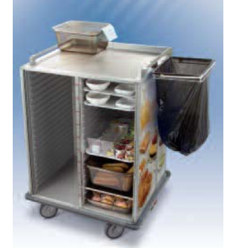
Keep one pit clean for unused stuff