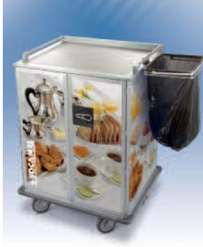
Tray pick up set up